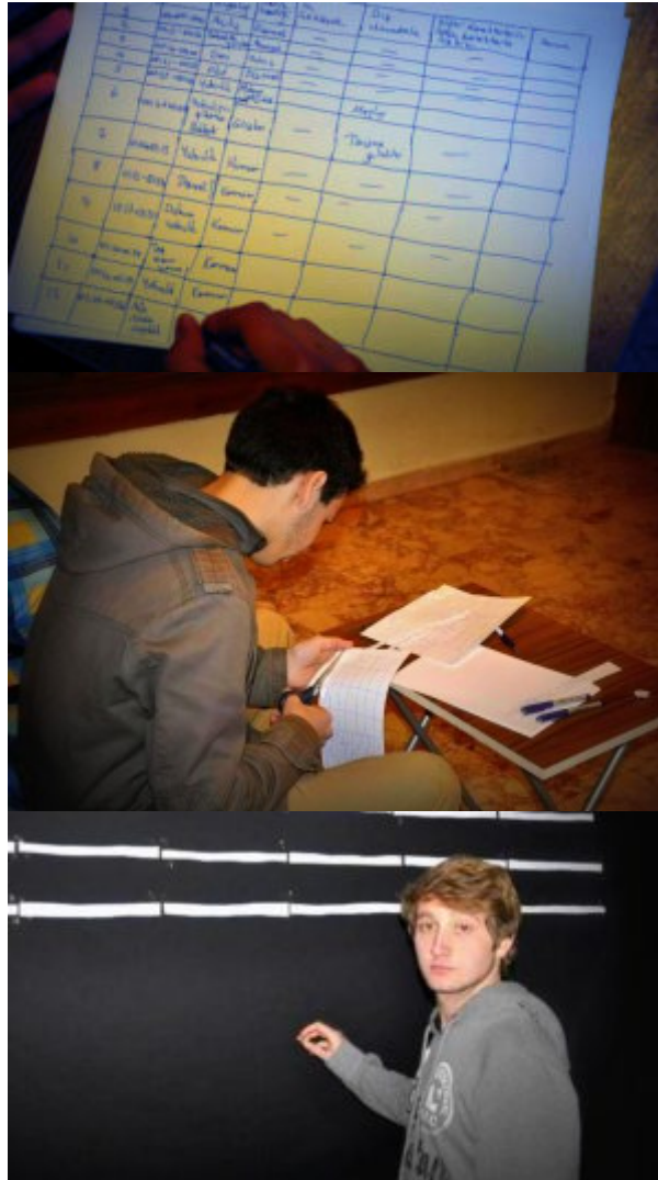
A group of young people analysing a film